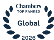
Schellenberg Wittmer Ltd