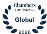
Schellenberg Wittmer Ltd