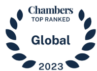
Schellenberg Wittmer Ltd

Schellenberg Wittmer Ltd is your leading Swiss business law firm with more than 150 lawyers in Zurich and Geneva, and an office in Singapore. We take care of all your legal needs – transactions, advisory, disputes.