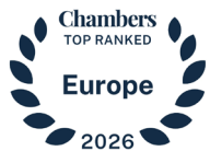
Schellenberg Wittmer Ltd

Schellenberg Wittmer Ltd is your leading Swiss business law firm with more than 150 lawyers in Zurich and Geneva, and an office in Singapore. We take care of all your legal needs – transactions, advisory, disputes.