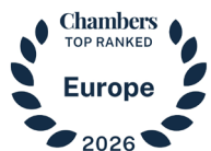
Schellenberg Wittmer Ltd

Schellenberg Wittmer Ltd is your leading Swiss business law firm with more than 150 lawyers in Zurich and Geneva, and an office in Singapore. We take care of all your legal needs – transactions, advisory, disputes.